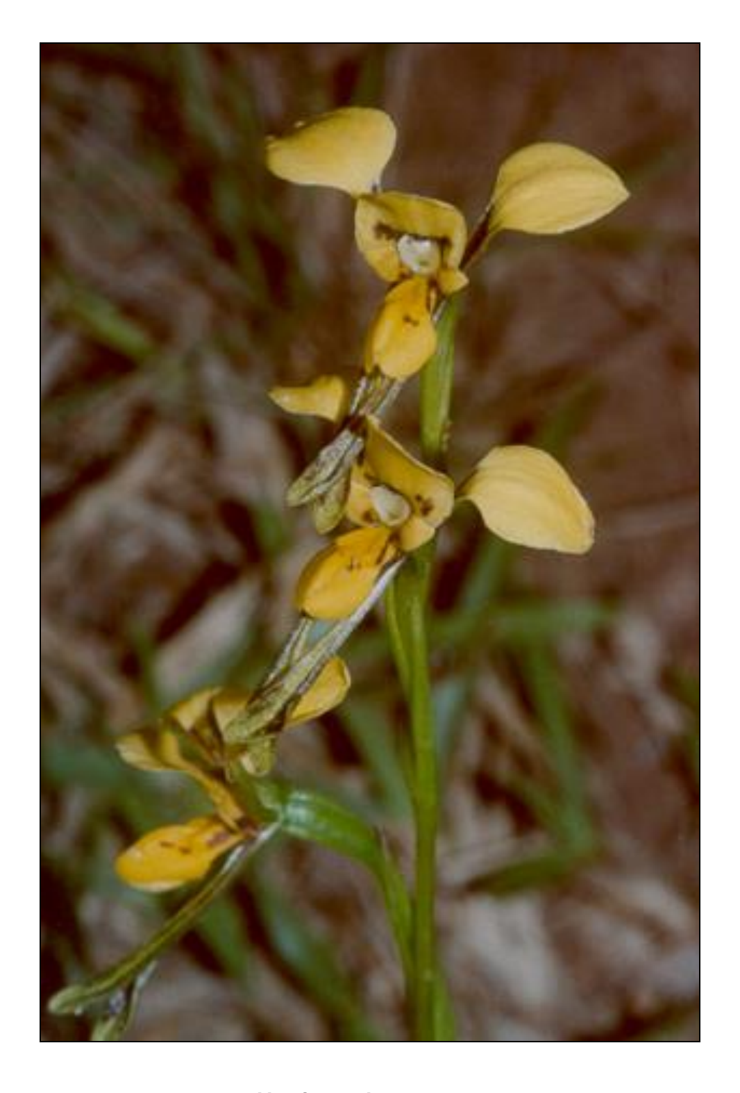
Version 8, August 2019