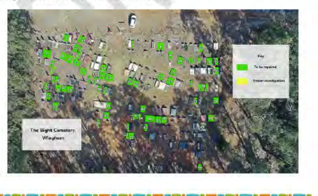
The Bight Cemetery - Restoration Action Plan - November 2019

An investigation into the condition of the headstones identified both by Council and by the community has confirmed there are 67 headstones in need of repair. Council has committed publicly and to family members that all 67 headstones will be repaired, regardless of how that damage was sustained (through Council actions or the December 2018 storm).