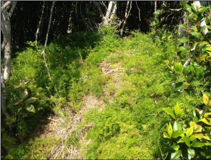
Above: Dense infestations of asparagus at Blackhead

Asparagus is a major weed problem that is quickly invading the littoral rainforest on the headland at Blackhead and the coastal vegetation growing on the dunes at Blackhead Beach. The asparagus is impacting not only the understorey of the forest, but also the steep escarpment of the headland and is beginning to displace the native vegetation. In a bid to help control the spread of the weed we have partnered with the Hallidays Point Landcare Group to fund a professional bush regenerator to supplement the long-term efforts carried out by Hallidays Point Landcare volunteers. A continual program of control will be required to curb the spread of this species so this project is likely to continue for many years.