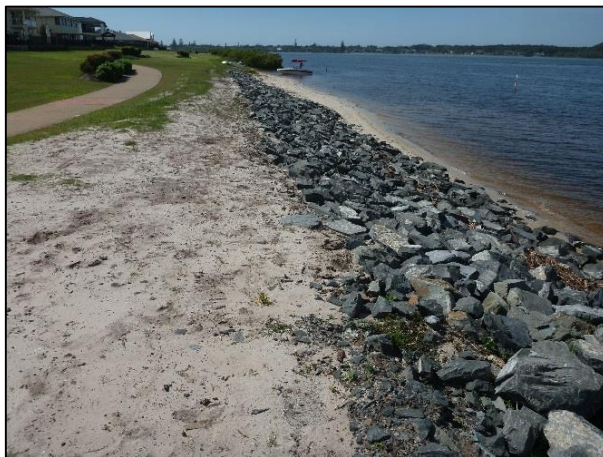
Above: Harrington Waters Rock Revetment