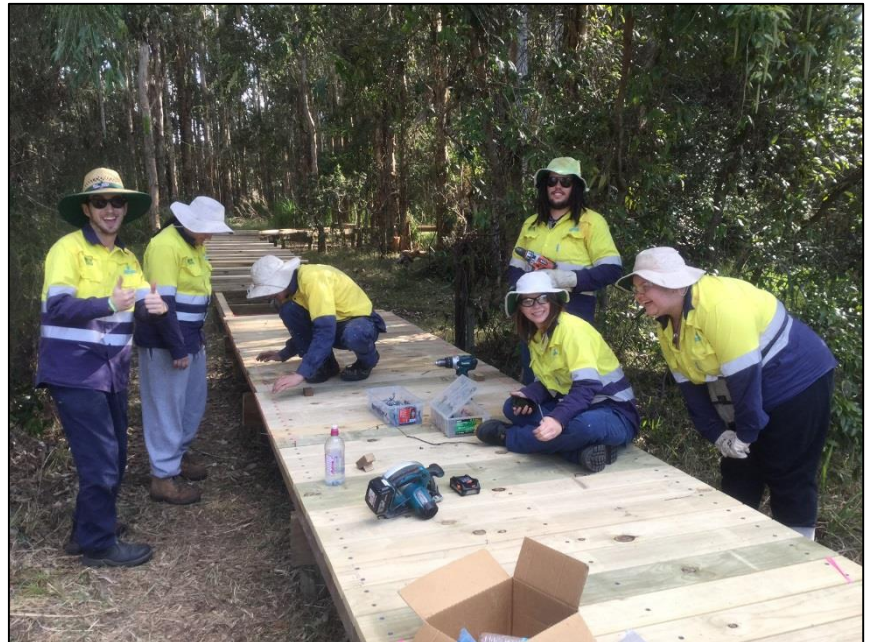
Above: Green Army Team constructing a boardwalk at Cattai Wetlands

Teams will commence in July 2016 and run over a period of 12 months.