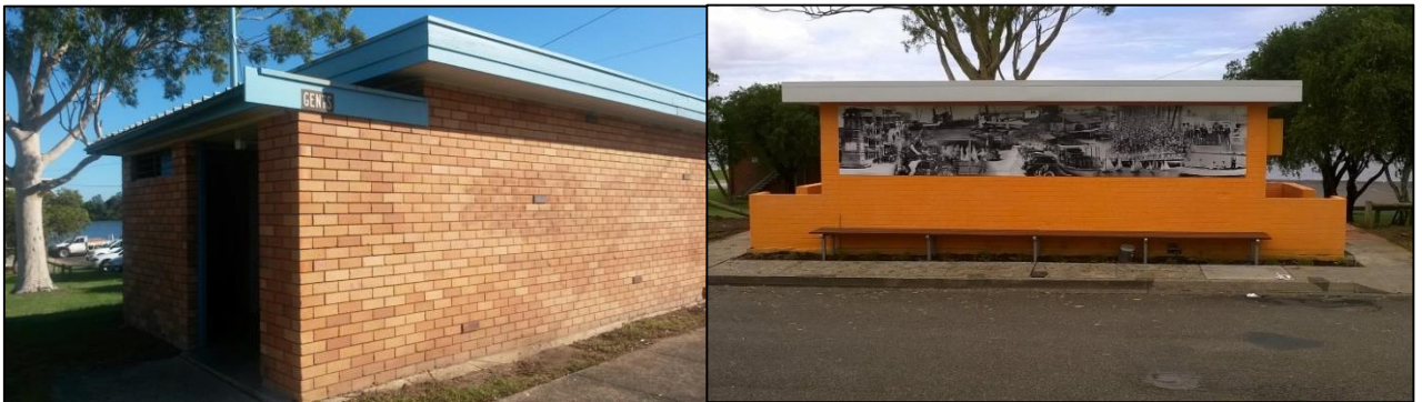
Above: Endeavour Place Toilets before and after refurbishment

Stage 1 of the Endeavour Place upgrade has involved a partnership with the community group 'Tidy up Taree' who, using volunteer labour, have refurbished the existing run down toilet block. Subsequent stages of the upgrade will see the resurfacing of the Endeavour Place car park, extension of the boat ramp, as well as additional footpaths providing access between the foreshore, toilet block and Bicentennial Park.