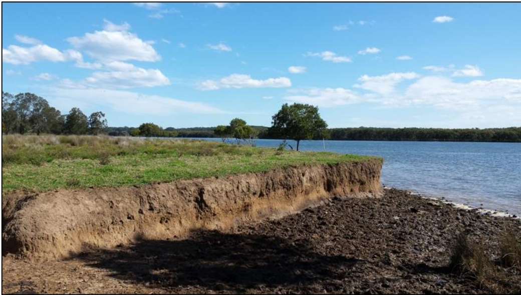
Above: Riverbank Erosion at Harrington

A contract for the construction of rock filllets along 540 metres of severely eroding riverbank on a property at Harrington has been awarded with work to begin in January 2016. 1km of stock exclusion fencing will be erected to further protect the riverbank from erosion plus the planting of native trees and shrubs once stock have been removed.