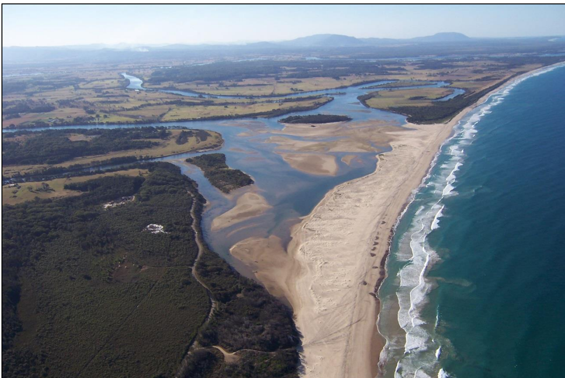
Above: Farquhar Inlet, Old Bar

MHL have reviewed over 100 documents relating to the study area and are likely to finalise their investigation in February 2016. We will review this work before commencing discussions with key government agencies, in particular the NSW Office Environment and Heritage, to determine the impact this new knowledge will have on previously identified management options for the coast. The results of the investigation will help us to develop an appropriate and practicable management plan for our coastline, and meet the requirements of the NSW Coastal Reforms which are currently in draft form but expected to be in force by mid 2016.