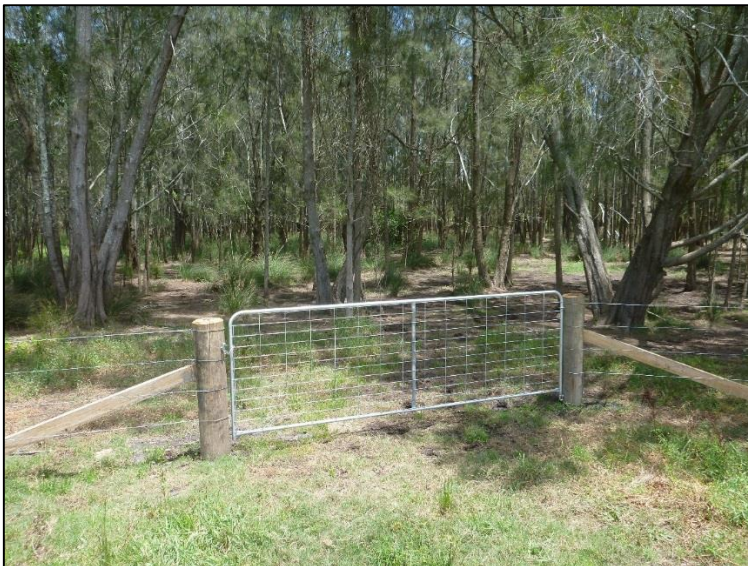
Left: Fencing at Browns Creek with Swamp Oak Floodplain Forest in the background

Other water quality improvement projects to be implemented early in the new year include the installation of a Gross Pollutant Trap in Wrigley Park to prevent litter from entering Brown's Creek and the construction of a rain garden to help filter out harmful pollutants. All of these projects are being funded through the NSW Estuary Management Program with matching funding provided through the environmental levy.