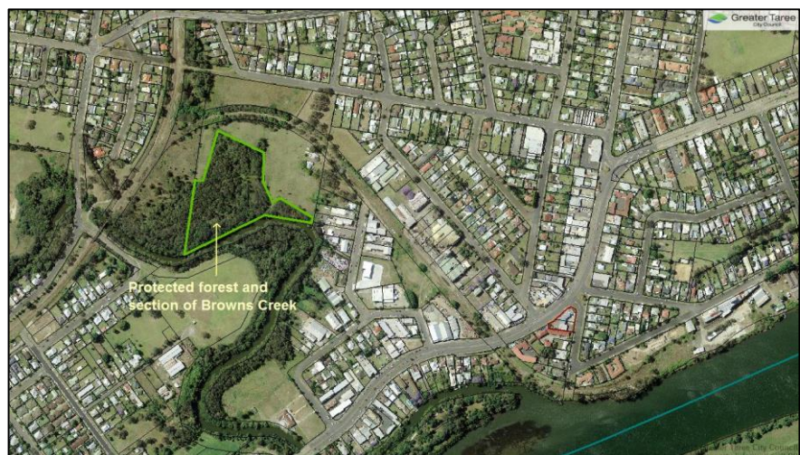
Right: Site location