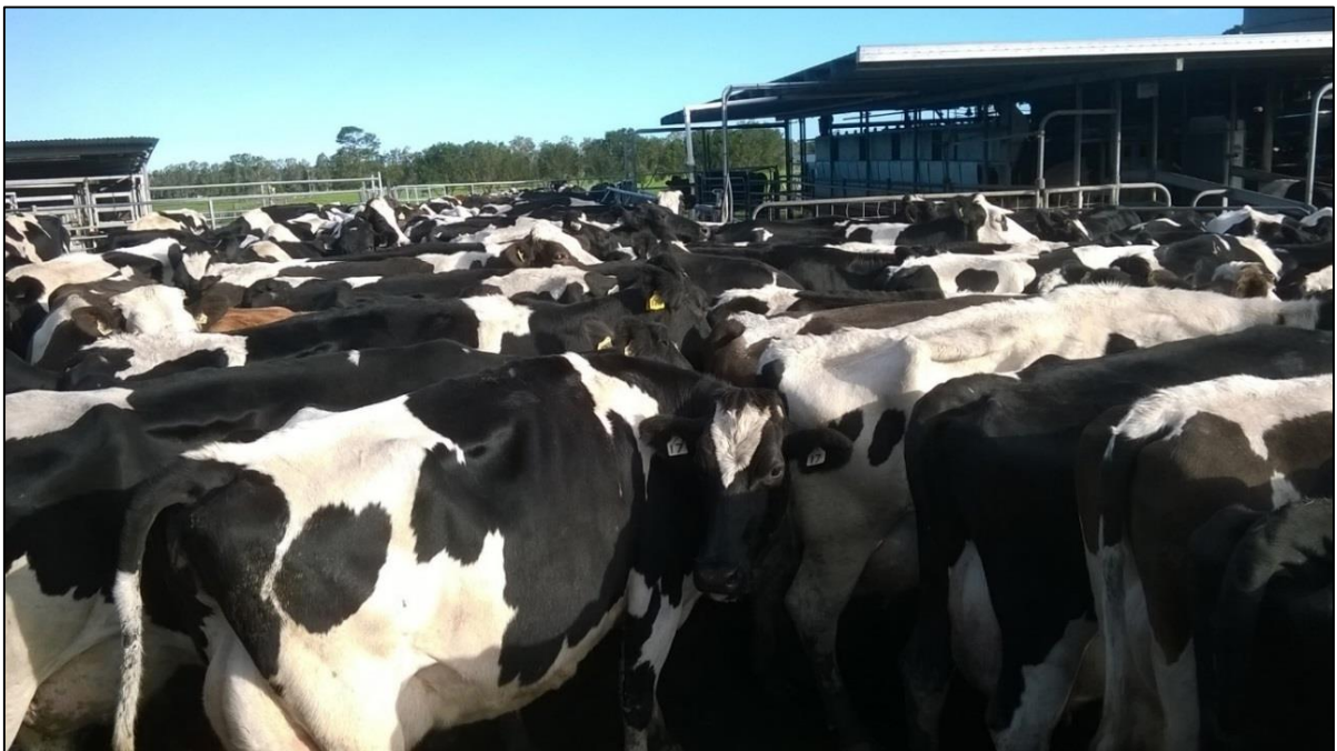
Above: Dairy Farm at Harrington

Both projects will help to reduce the amount of nutrients entering the river which can result in high concentrations of chlorophyll A – the main cause of algal blooms.