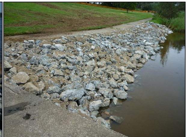
Above: Manning Waters Rock Revetment