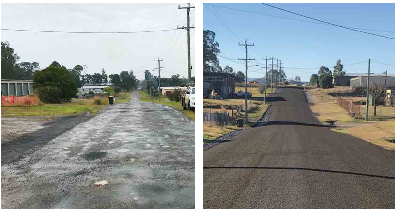
Britten Street, before (left) and after (right)

And coming up over the next 12 months is another busy schedule that will see significant improvements right across the region. Some of the works already scheduled or underway include Hadley and Townsend Streets in Forster, Albert, Muldoon and Pulteney Streets in Taree, Queen and Hume Streets in Gloucester, Boomerang Drive at Pacific Palms, Manning Point Road at Mitchells Island, sections of Old Bar Road, The Lakes Way at Charlotte Bay, Avalon Road at Krambach, and Blackhead Road at Hallidays Point.