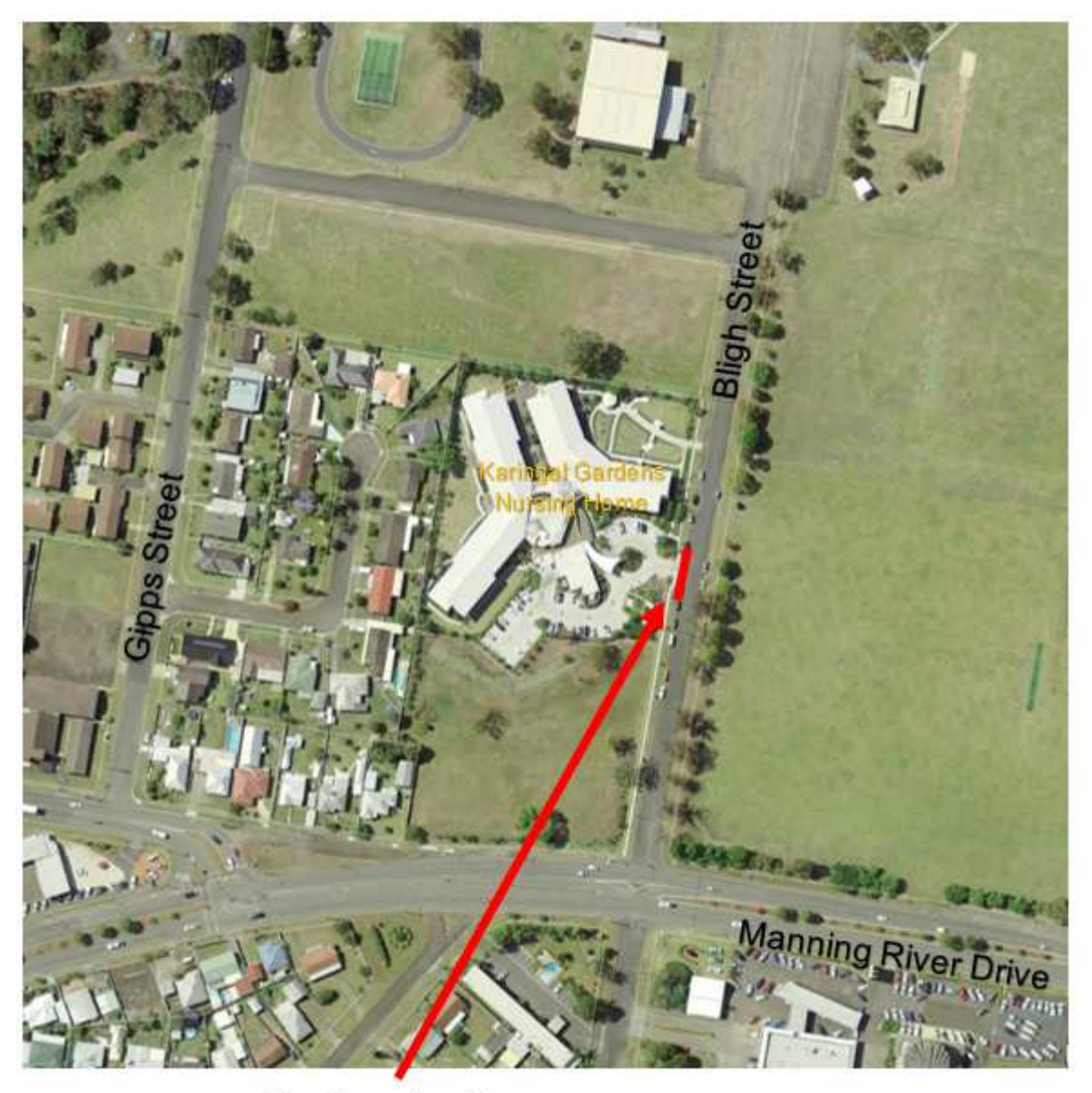
No Stopping Zone

A: Bligh Street, Taree – No Stopping Zone.