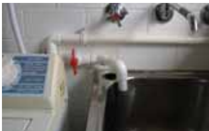
Grey to Green diversion device www.greytogreen.com

A surge tank for a greywater diversion device does not act as a storage tank, but a temporary holding tank to allow an even flow of greywater to your garden.