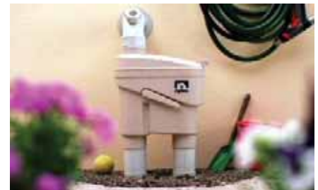
Gravity diversion device from Nylex www.nylex.com.au

A surge tank for a greywater diversion device does not act as a storage tank, but a temporary holding tank to allow an even flow of greywater to your garden.