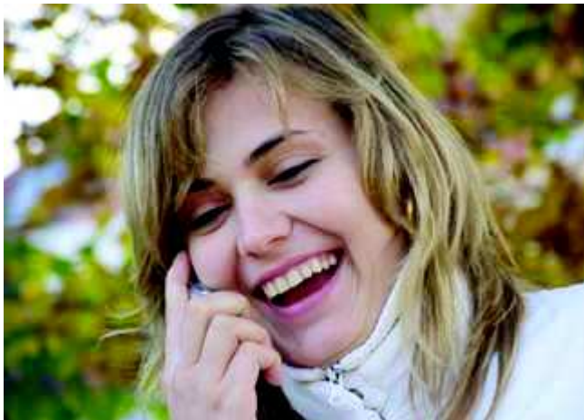
Photo: National Field Services is conducting phone surveys on behalf of MidCoast Council through September.

The project is a partnership between the NSW Department of Premier and Cabinet and the 19 newly merged councils.