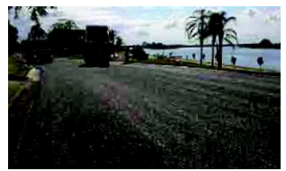
L to R: Pile splicing; bridge repairs; Resealing: Manchester Street, Tinonee; River Street, Taree

A program of works is already underway using savings achieved in Year 1, broken down as follows: