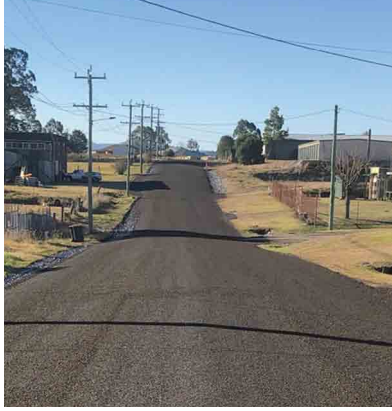
Britten Street, before (left) and after (right)

The special rate variation (SRV) was introduced on 1 July this year and is dedicated exclusively to addressing the condition of the region's roads and bridges with another component supporting environmental works across the region. It is anticipated that additional funding from the State Government of up to $50m may be secured in addition to the SRV, which if successful, will double the value contributed by ratepayers to improving local roads. This funding program will significantly reduce the gap in renewals funding and backlog in a relatively short timeframe.