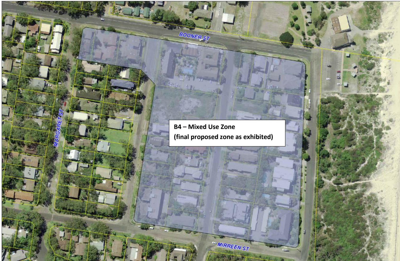
Figure 2: Area B – Proposed land use zone (as exhibited)